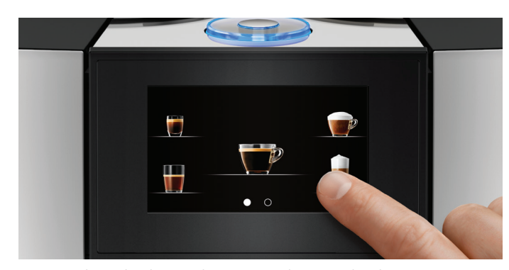
A 2.8" colour display, six buttons and a completely new operating concept. An intelligent algorithm identifies individual preferences and adapts the start screen so the user's two or four favourite specialities are always displayed.

The operating concept is based on simplicity and intelligence. The JURA S line creates a new segment in coffee machines: the premium mid-segment.