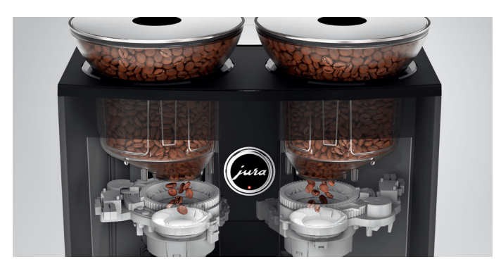
More aroma and consistently high grind quality over the entire service life are the defining features of the Professional Aroma Grinder. The perfected grinder geometry achieves the optimum grinding curve.