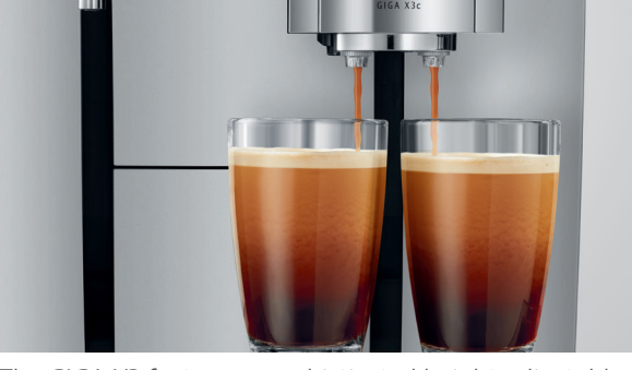
The GIGA X3 features a sophisticated height-adjustable dual spout, which finishes off trend specialities with milk and milk foam to perfection thanks to fine foam technology. The speed function ensures speciality coffees in record time.