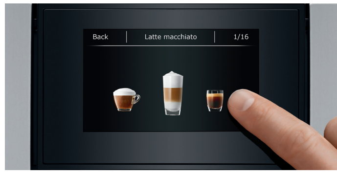
The concise, 4.3" high-resolution touchscreen colour display is completely intuitive. Modern graphics that are easy to understand mean that even first-time users can navigate with confidence.

What's more, the high capacity of the water tank, drip tray and coffee grounds container maximizes autonomy, making the GIGA X3 ideal for mobile use too.