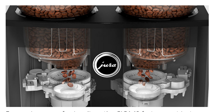
For maximum professionalism, the GIGA 10 features not just one but two high-performance grinders made of a long-lasting, high-quality ceramic material.