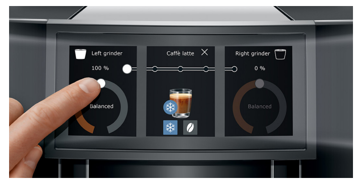
For maximum clarity and even more intuitive operation, the GIGA10 comes with a new touch-operated panel in wide panoramic format. The new panel allows you to see everything at a glance.

With two bean containers, each with its own grinder, the revolutionary cold extraction process, an innovative panorama panel for ease of use and an intuitive new operating concept, the GIGA 10 offers a wider choice of speciality beverages than ever before. It is presented in a stunning design that impressively emphasizes the power of this unique machine. The GIGA 10 recreates the experience of barista-crafted coffee at home, transforming your kitchen into a coffee bar with just the touch of a button.