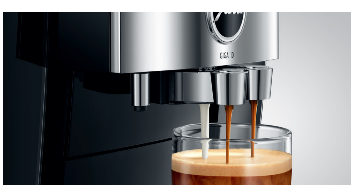
With a total of 35 speciality coffees, the GIGA 10 offers the widest choice of any JURA coffee machine. It also includes long black as well as 'cold brew' as the latest innovation of JURA.