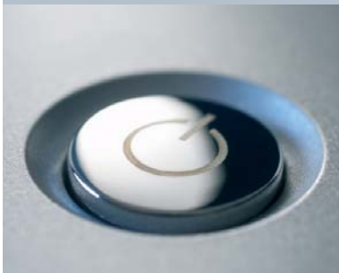
Eco - Intelligence